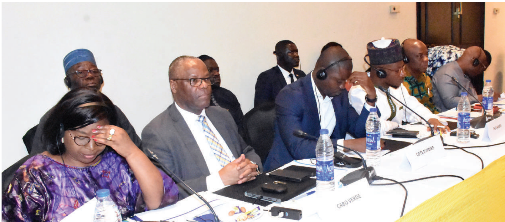
Cross section of ECOWAS Ambassadors during the 2024 United Nations High Commissioner for Refugees (UNHCR) Retreat in Port Harcourt at the Weekend.