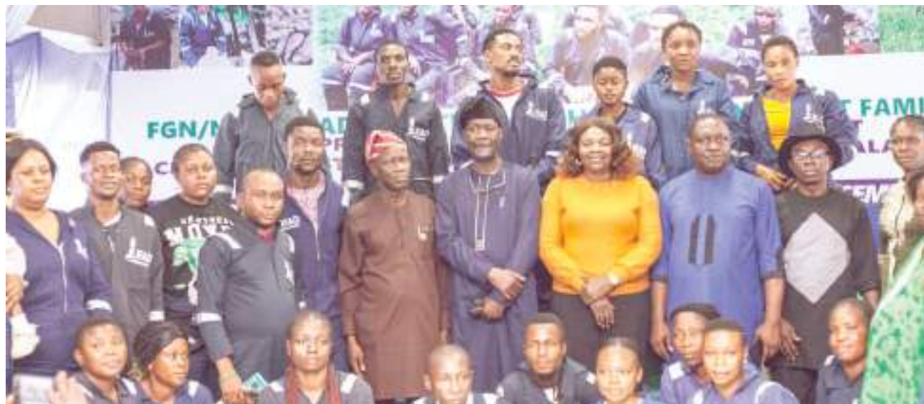
Cross River State beneficiaries of the Livelihood Improvement Family Enterprises in the Niger Delta (LIFE-ND) project

He thanked the organisers for the recognition and pledged his support towards ensuring a successful award ceremony.