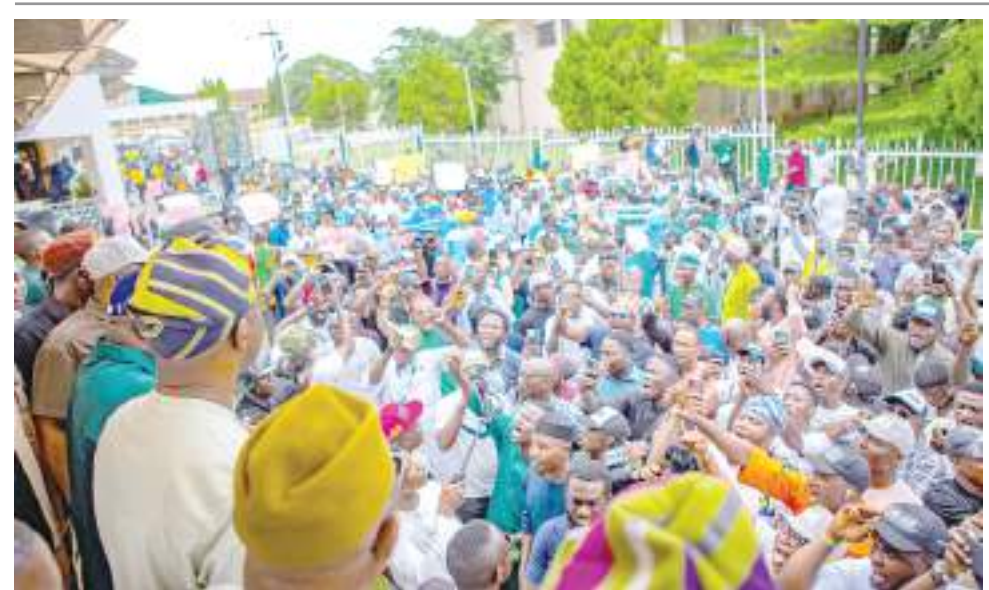
Oyo State governor, Seyi Makinde (left), addressing the National Association of Nigerian Students (NANS), Nigeria Union of Teachers (NUT) and the Nigeria Labour Congress (NLC) during a protest to the Governor's Office, Secretariat, Ibadan on the abduction of teachers and pupils in Oriire Local Government Area of Oyo State, on Tuesday.

·Hold in Kogi, Lagos, Kwara, Rivers, Benue, Edo, Oyo, Ondo, Osun, Cross River, FCT ·NANS, NLC join in solidarity ·Senate, Reps condemn attack, warn against politicising insecurity ·Our priority is safe return of our students, not politics —Makinde ·CAN declares three-day national mourning, June 14 'Black Sunday', demand state of emergency on security