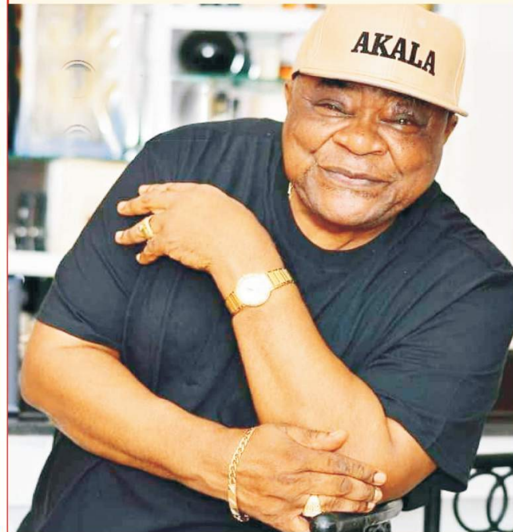
Dr Christopher Adebayo Alao-Akala (1950-2022) Former Executive Governor of Oyo State