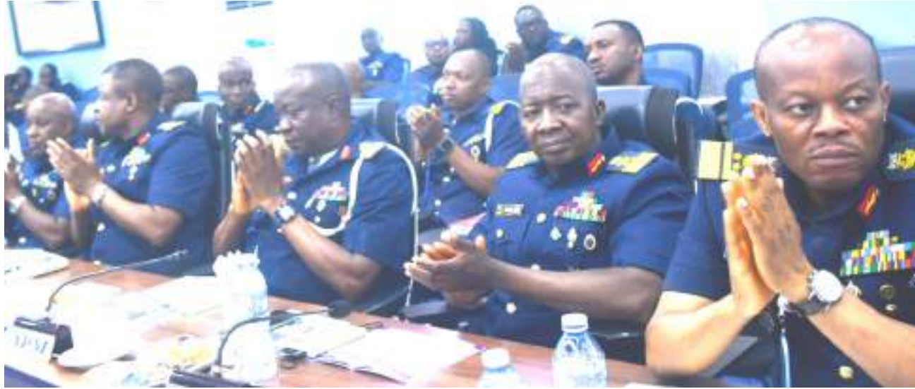
Some participants during the Nigerian Air Force Civilian Harm Mitigation and Response Seminar, in Abuja, on Tuesday.

"The girl further explained that after her mother collapsed, her father placed her inside the tricycle, apparently intending to take her to the hospital, but when he realised that she had died, he abandoned her body and the children and fled."