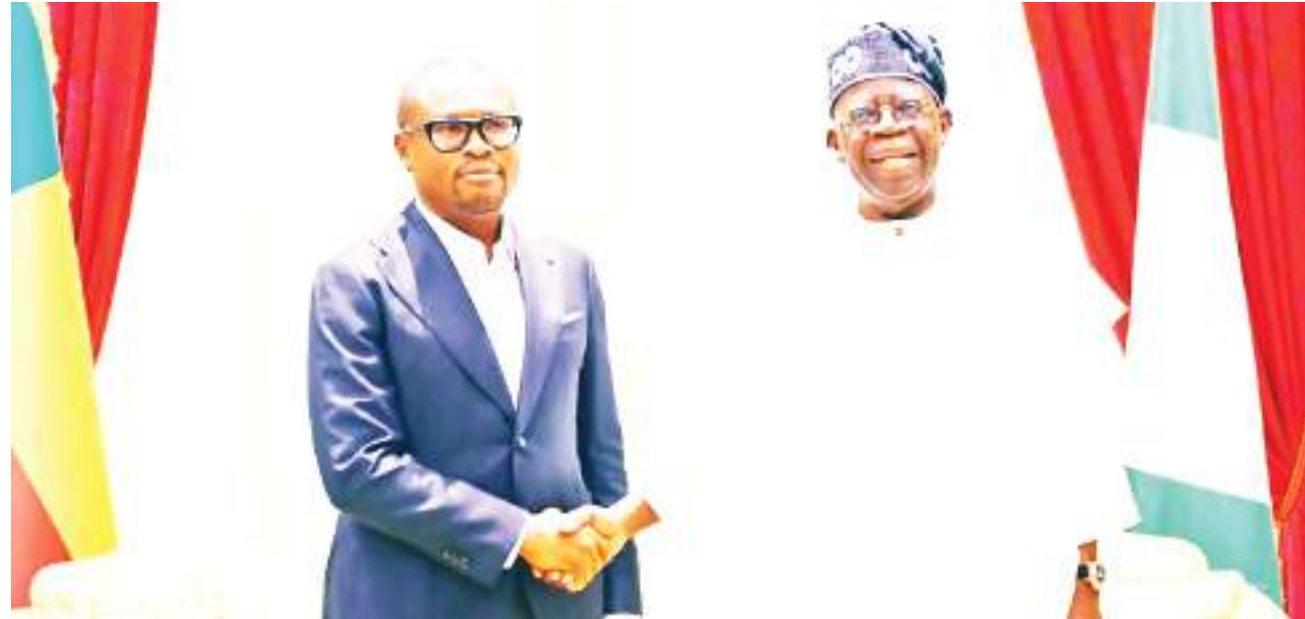
President Bola Tinubu receiving the president of the Republic of Benin, Romuald Wadagni, during his visit to Nigeria.

The national commissioner urged members of the public and the media to disregard unfounded speculations while investigations remain ongoing, adding that the Commission will continue to keep the public informed of its final findings and any measures taken in response to the incident in due course.